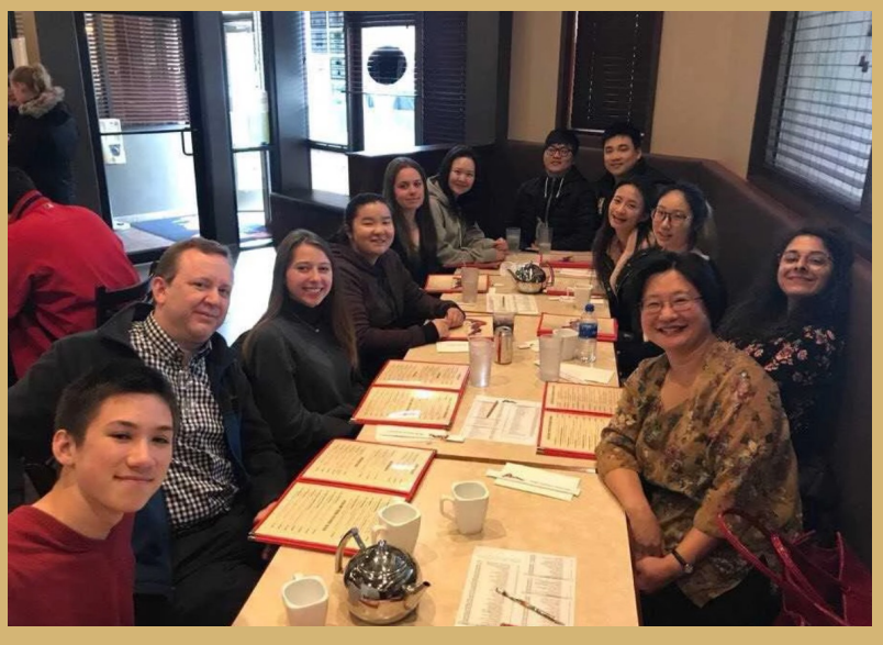
FAREWELL PARTY AT MARU